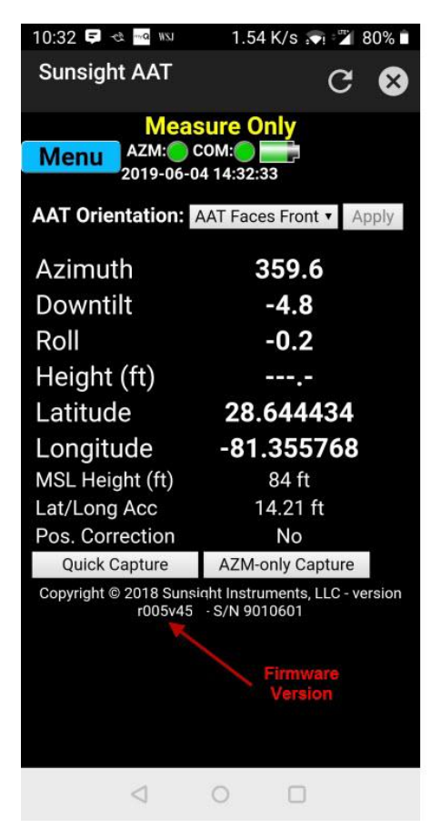
Firmware version for this AAT was r005v45